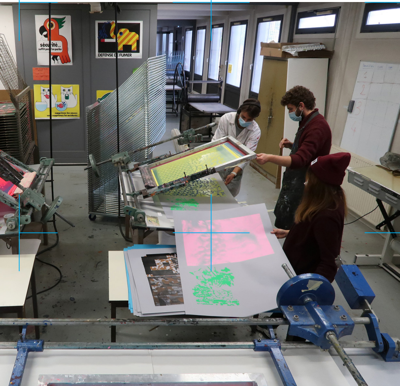
ÉSAD Valence, Fall 2021.

It's a fast, powerful and versatile technique that offers many artistic possibilities at various sizes.