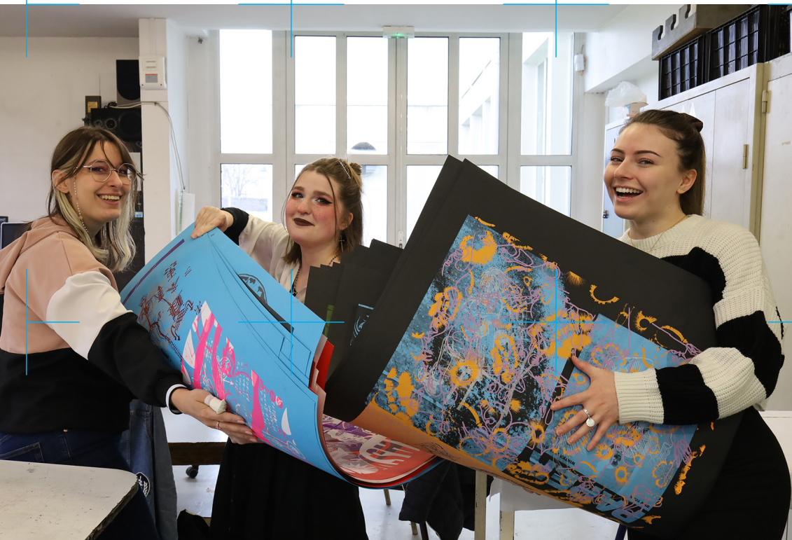
ISBA Besançon, Spring 2022.

End of the week, all should go home with plenty inspiration and ideas for future individual projects.