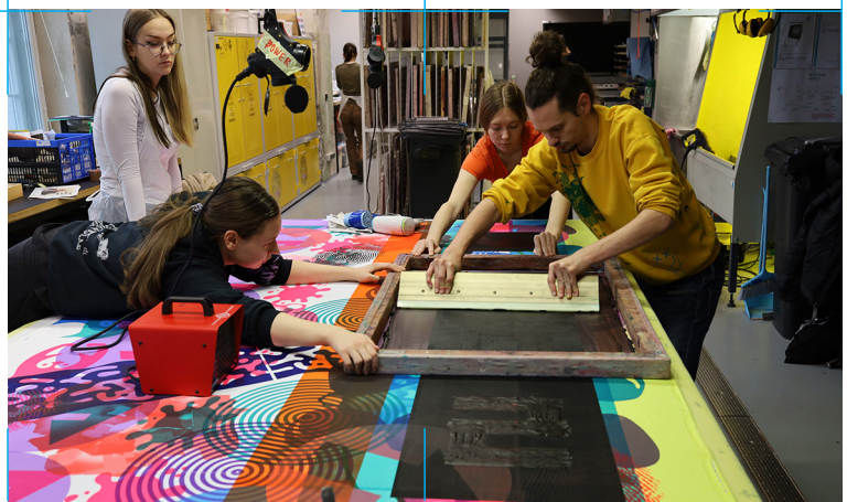
EKA Tallinn, Fall 2022.