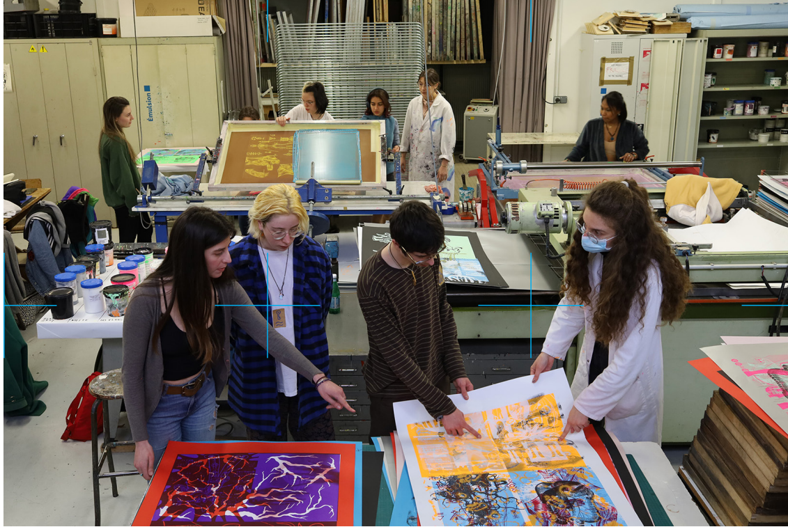
ISBA Besançon, Spring 2022.